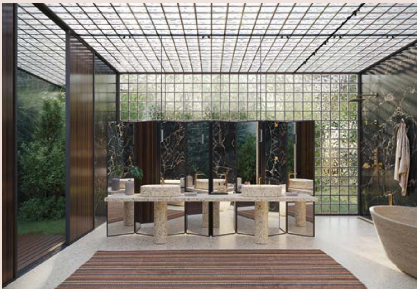
CULTURE THEMED PENTHOUSE

As part of its “Make it yours!” campaign, AXOR asked the renowned architect-designer to develop not one but two distinctive bathroom concepts to showcase the remarkable versatility of his latest collection, AXOR Citterio C. Minimalist in spirit, with soft contours and a sensuous form, the new collection—which includes a range of fixtures for the washbasin, bathtub and shower—invites the touch while intriguing the eye from every angle.