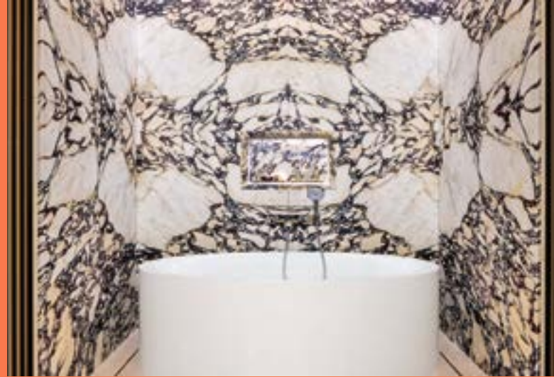
Bath and shower fixtures from the AXOR Citterio collection in classic Chrome brilliantly complement the luxurious surfaces and refined design of each hotel bathroom.